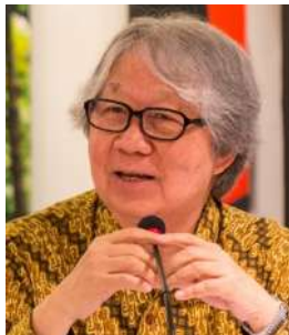
Ambassador Tommy Koh Emeritus Professor of Law, National University of Singapore; Ambassador-At-Large at the Ministry of Foreign Affairs, Singapore

Tommy KOH is currently Emeritus Professor of Law at NUS; Ambassador-At-Large at the Ministry of Foreign Affairs; and Chairman of the International Advisory Panel of the Centre for International Law at the NUS.